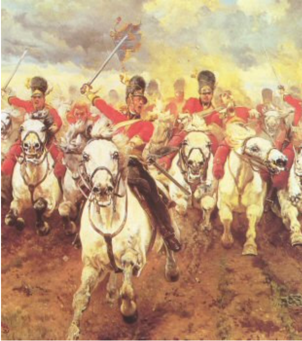
The Royal Scots Greys