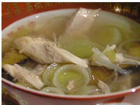
Recipe courtesy of Gary Davidson

350g (12oz) Chicken portions 350g (12oz) Leeks 15g (½ oz) Butter 1.1 litres (2 pints) Chicken Stock 1 Bouquet Garni Parsley